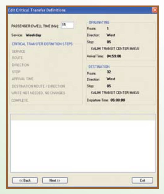
Photo Above: A screenshot of the critical transfer interface in TransitMaster.

There is a wealth of new features available now in TransitMaster. We have a lot of progressive things in store, and welcome your feedback as to how to improve this system in the years to come. What's next? Without revealing too much, imagine if you didn't have to ever change your destination sign ever again... if it was all automatic. More to come on this.