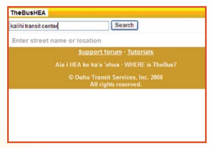
Photo Above: HEA home page, where you can type in either the stop number or the street names of the stop.

As a result of Chad's initiative, users of the HEA system have the ability to make informed decisions on their daily commute, and has made riding TheBus a more convenient and enjoyable experience.