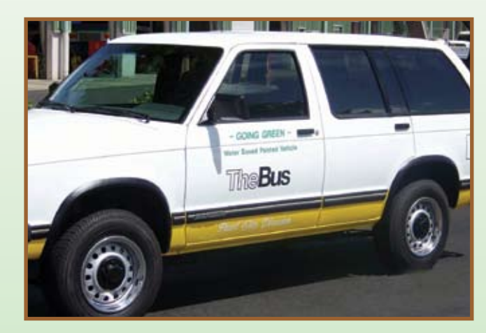
Photo Above: The first of many TheBus shuttle vehicles painted with the new water-based paint.

The Company has shown tremendous foresight and responsibility by taking positive steps in the direction of green. I hope everyone can share in the pride of knowing we all work for a Company that really does care for its people and these precious Islands we call home.