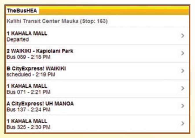
Photo Above: The HEA page that shows the list of buses arriving at the selected bus stop. For instance, the Kalihi Transit Center.